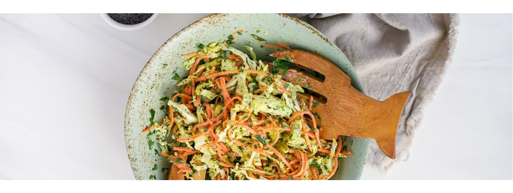
Kefir & Cabbage Poppy Seed Slaw